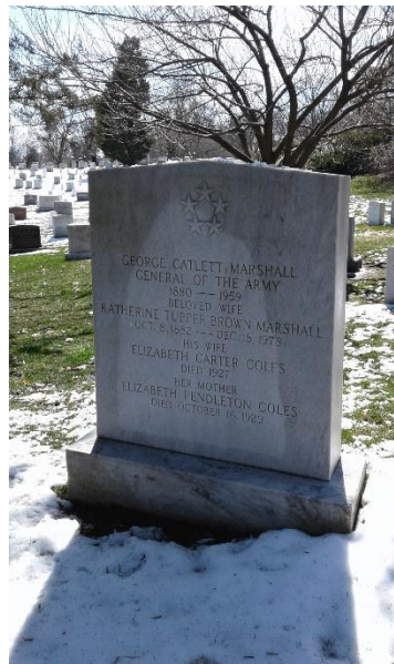
Marshall's Grave Marker at Arlington National Cemetery 3/22/2018

memory remained strong through 1957, when his health began to decline even further. When President Eisenhower and former Prime Minister Winston Churchill visited Marshall at Walter Reed Hospital in 1958, Marshall could not recall who they were. Churchill bade his farewell to Marshall with tears in his eyes. 15 On October 16, 1959, the general passed away. In keeping with his wishes, Marshall's funeral and burial at Arlington National cemetery were quiet affairs, but were attended by former President Truman, Eisenhower, and many former associates and comrades from his life of government service. On October 20, 1959, George C. Marshall was laid to rest not far from the Tomb of the Unknown Soldier. As his biographer stated, "George Marshall had completed his tour of duty." 16